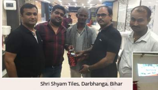
Shri Shyam Tiles, Darbhanga, Bihar

Here are a few images from our sessions: