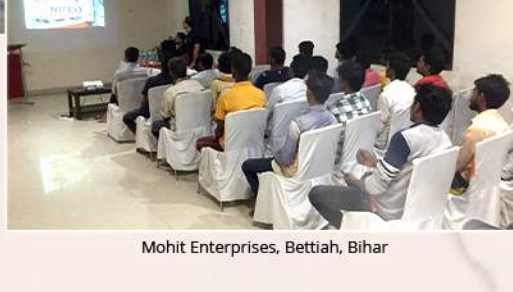
Mohit Enterprises, Bettiah, Bihar