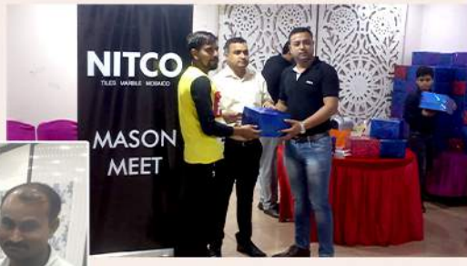
MS Tiles World, Ellanabad