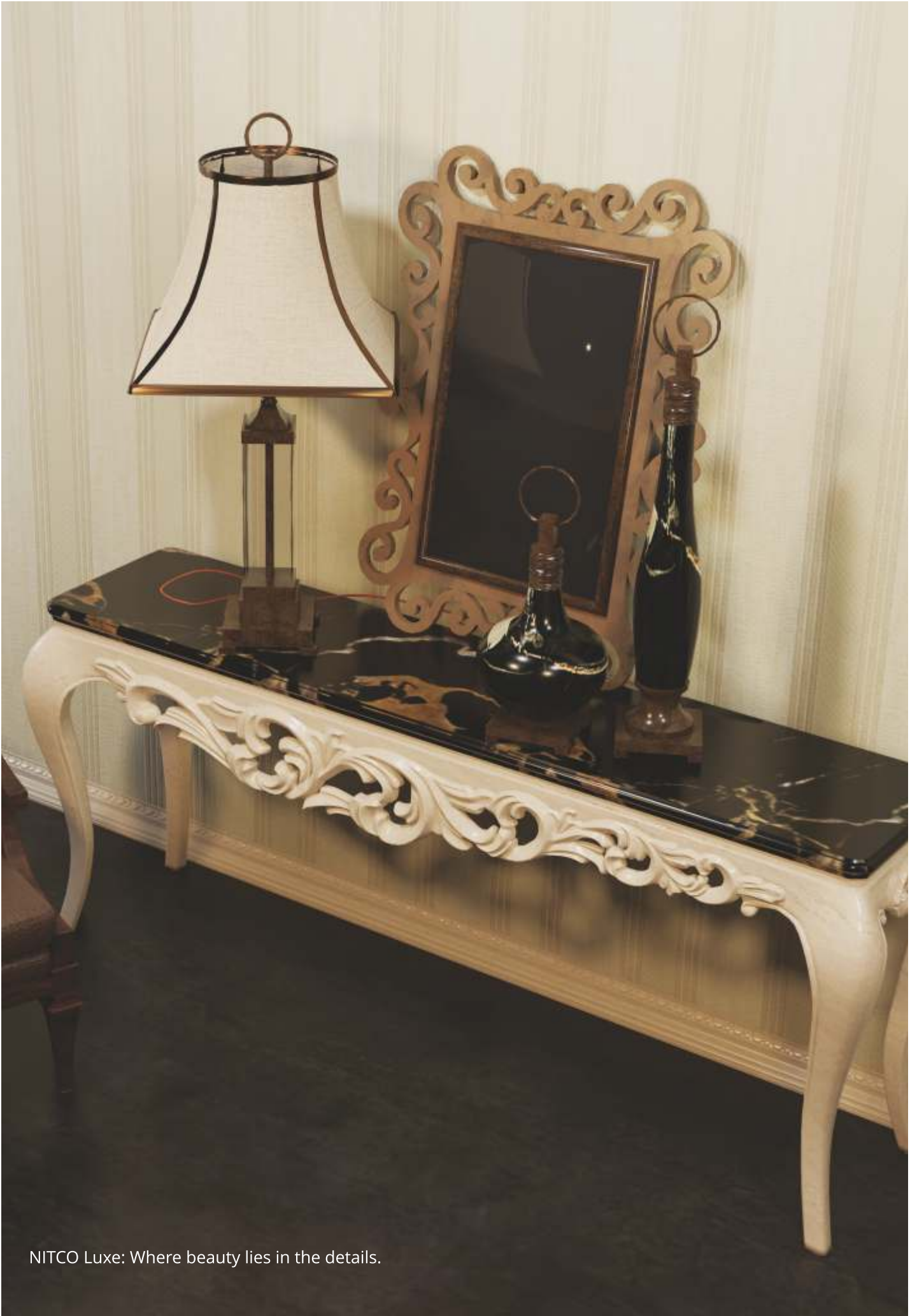
NITCO Luxe: Where beauty lies in the details.