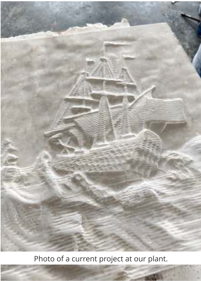
Photo of a current project at our plant.